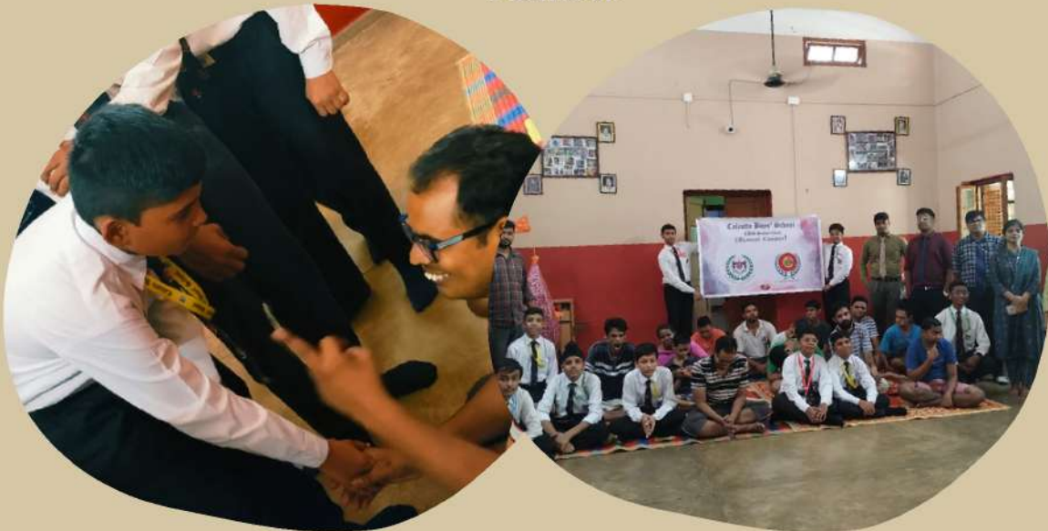
Calcutta Boys' School Asansol visited Asha Niketan community on 6th July.