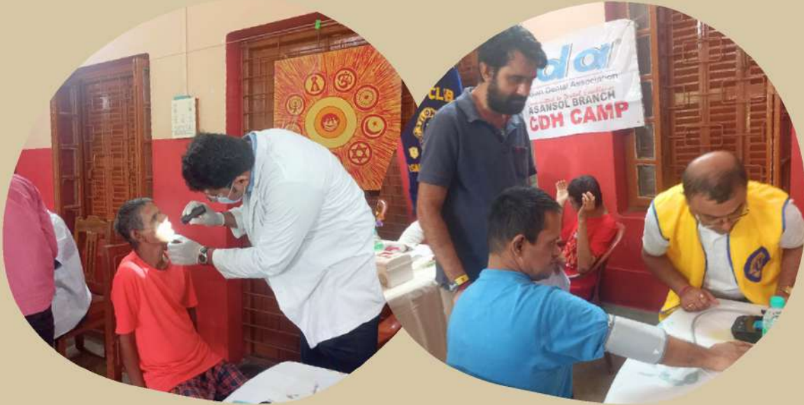
The Lions Club organized a medical camp on July 1st at Asha Niketan Asansol.