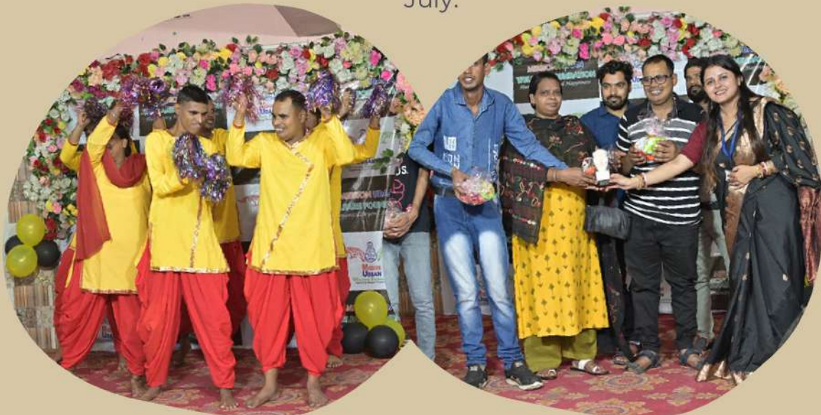
We performed a dance program to celebrate the anniversary of Mission Udaan Welfare Foundation-Raniganj